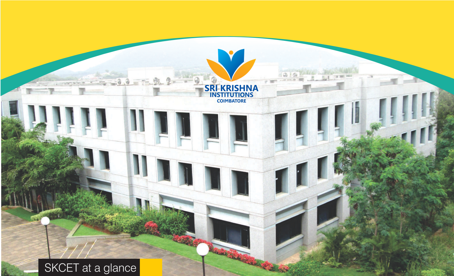
SKCET at a glance